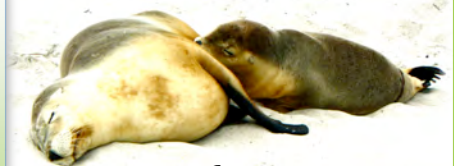
Fur seal spring pup. Kangaroo Island, SA